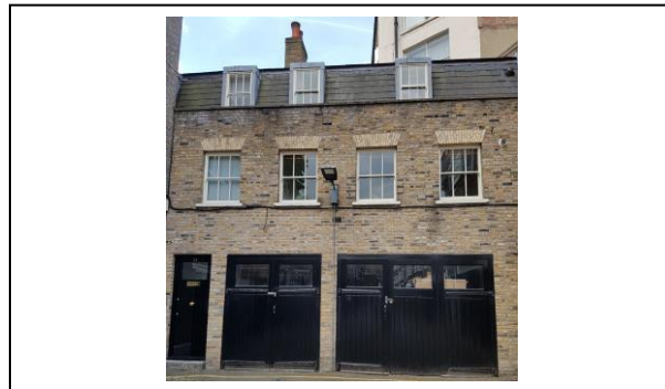
11 Gower Mews, London WC1E 6HP

Prepared For: The Bedford Estates 29a Montague Street London WC1B 5BL