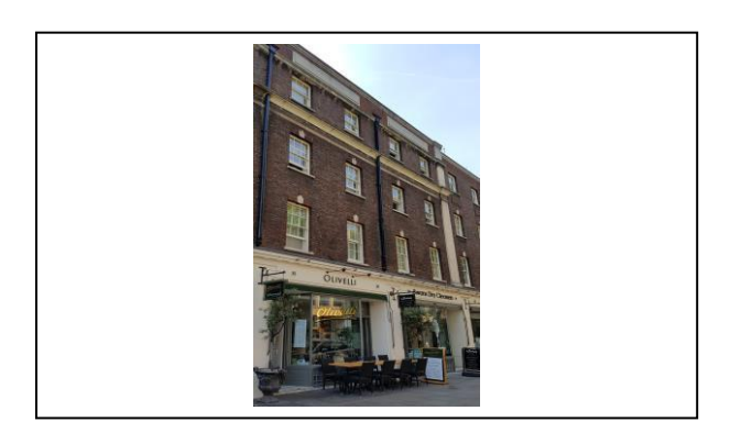
34 & 35 Store Street, London WC1E 7BS